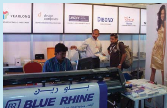
Blue Rhine at SIM 2010 Abu Dhabi.

The Design Composite stage sheets are available in 1 standard thickness and dimension 40mmx1000mmx2000mm.