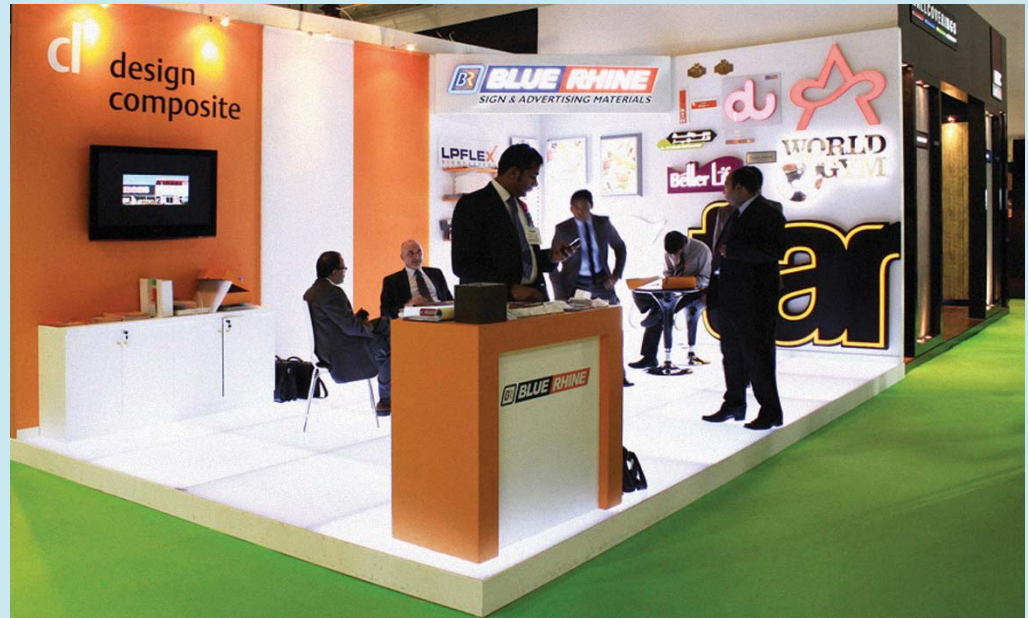
Blue Rhine Booth at INDEX 2010 made with Design Composite Stage.

The Design Composite stage sheet consists of 2 mm UV-protected PC cover sheets on a Polycarbonate TRICore honeycomb that enables the stage panel to have translucent optical features as well as an anti-slip surface. Appropriate for raised and illuminated floors with high load bearing capacity. The clear and translucent nature of the product allows it to be illuminated in any preferred color. The Blue Rhine Index 2010 stand was illuminated using cool white LED strips. Blue Rhine can cater to any color changing or color specific LED requirement needed for such a project.